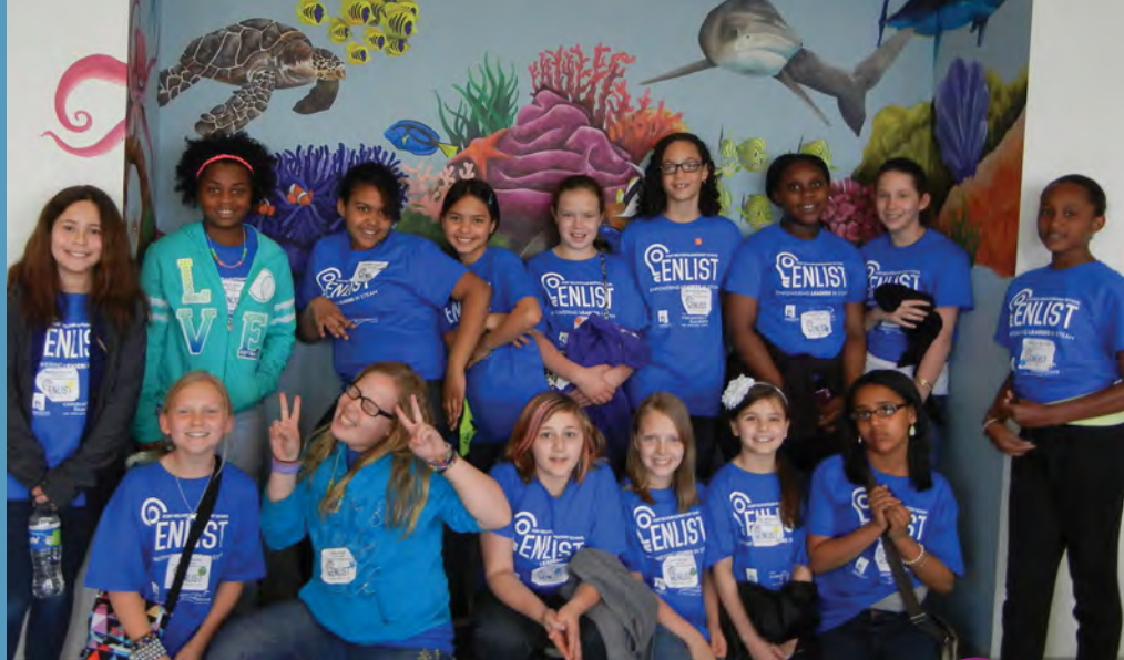
Marymount University's Empowering Leaders in STEAM program

THE BUSINESS WOMEN'S GIVING CIRCLE at the Community Foundation for Northern Virginia