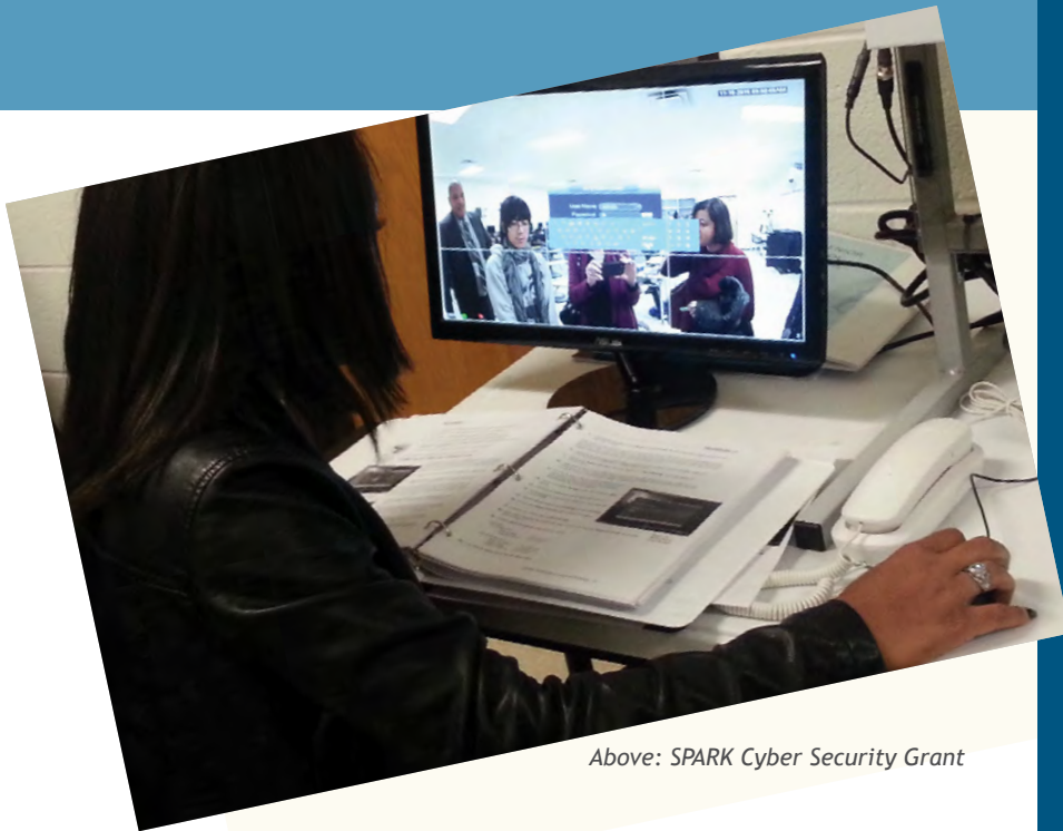
Above: SPARK Cyber Security Grant

The Innovation Fund at the Community Foundation for Northern Virginia invests in inventiveness, creativity and new design.