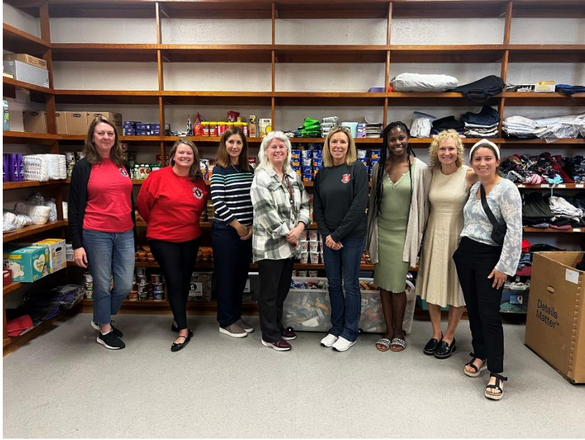
Site Visit with Food for Neighbors at Bryant High School