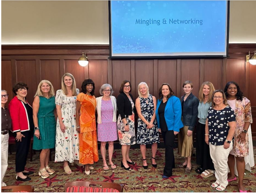
Business Women's Giving Circle celebrates 10 Year Anniversary