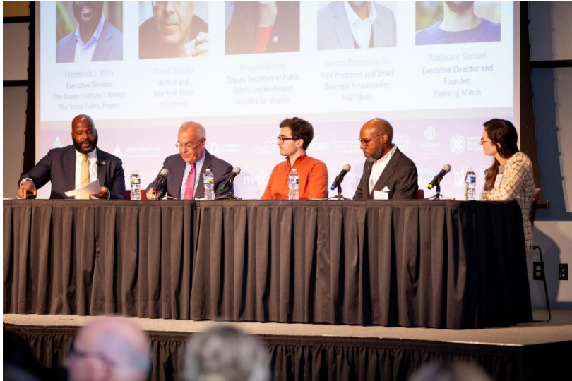
Shape of the Region Conference 2024