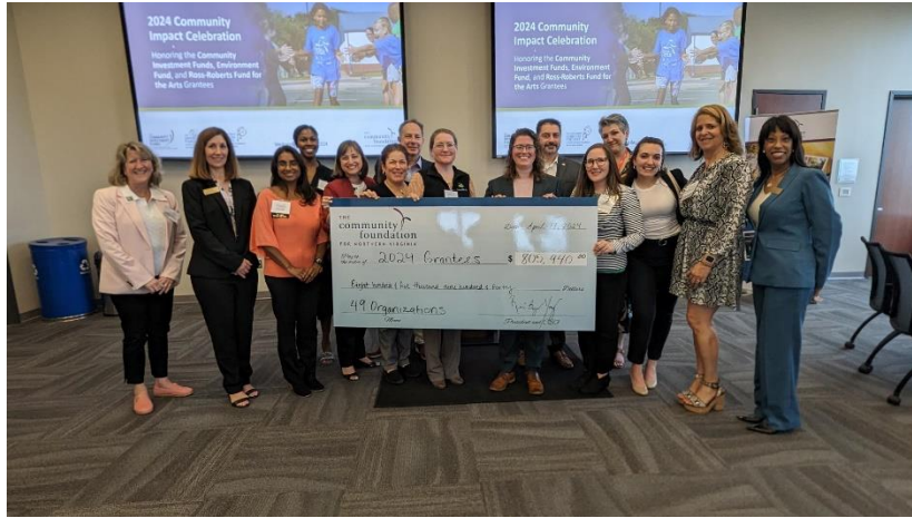
2024 Nonprofit Grantees celebrating with CFNOVA staff at the 2024 Community Impact Celebration