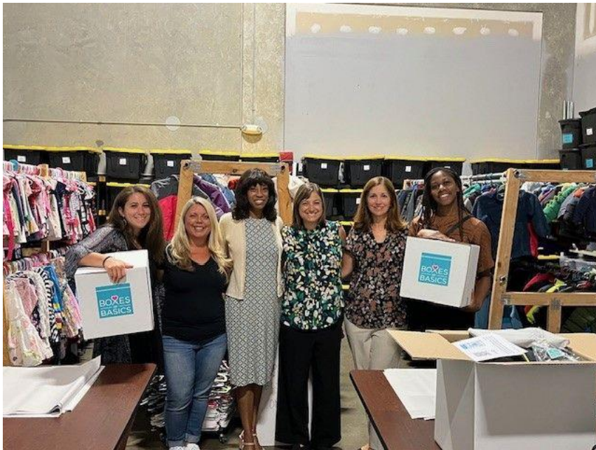
Site Visit with Boxes of Basics