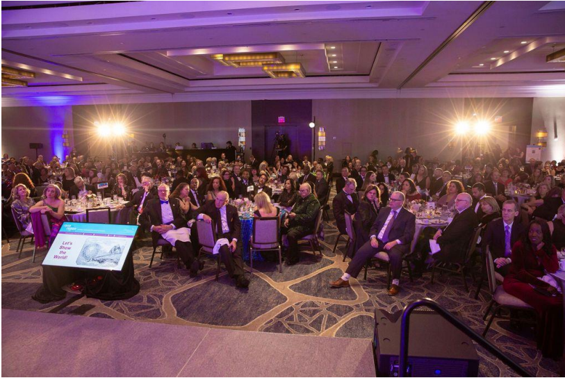
Raise the Region Gala 2024